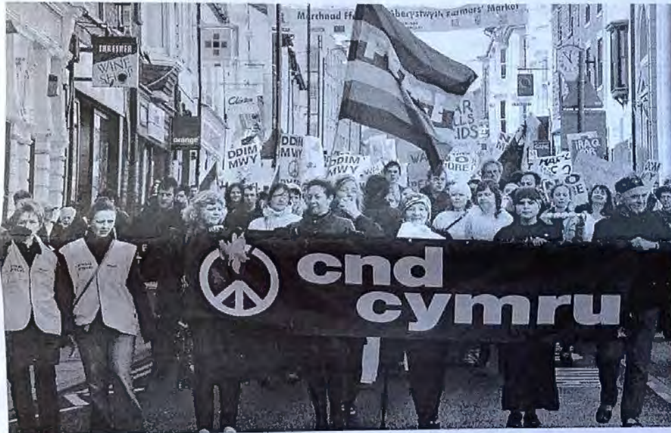
Aberystwyth - All Wales Rally for the Global Day of Action against War March 20th